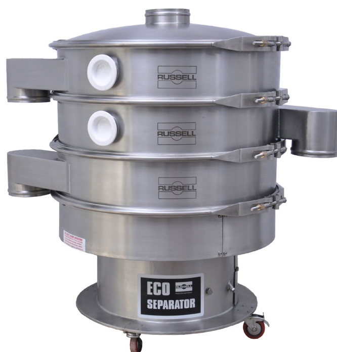
Figure 1. The Russell Eco Separator® is the most cost effective gyratory sifter for grading wet or dry materials up to five fractions.