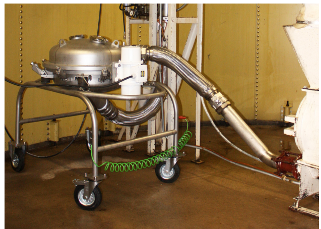
Figure 1. Blow Thru Sieve screening sugar after it passes through a silo

After conducting a search on the Internet, Ferrara Pan Candy contacted Russell Finex for the supply of a check-screening system. Following consultation with the local Russell Finex sales representative, it was decided that the Russell Blow Thru Sieve™ would be the most appropriate machine for the application. Russell Finex recommended this machine as it would fit neatly into the small space that they had available